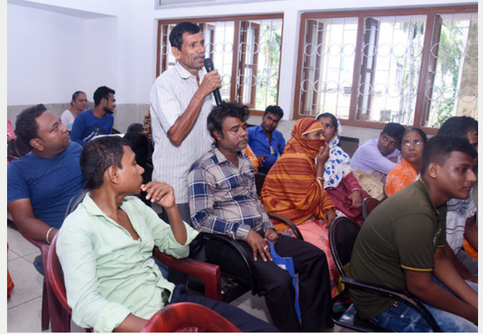
Awareness program conducted on 18th September 2024 on Medication compliance among patient's care - "Managing flare-ups, selfcare for caregivers"