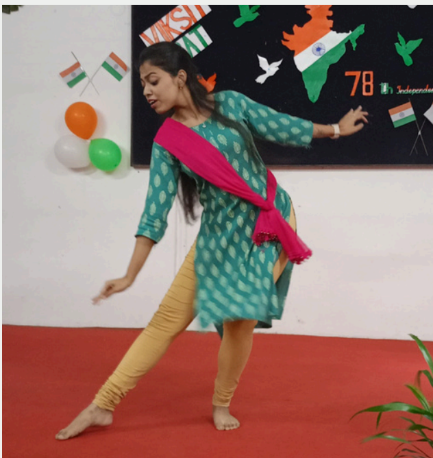
The Independence Day celebrations 2024