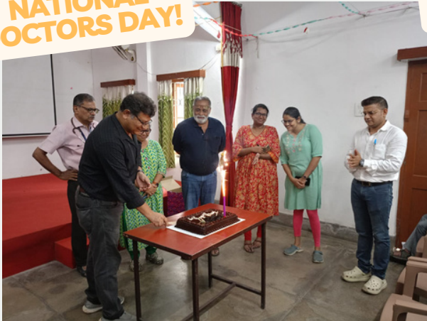
Celebrating National Doctors Day on 3rd July 2024