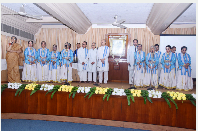
Aesthetic Therapy Unit, Antara