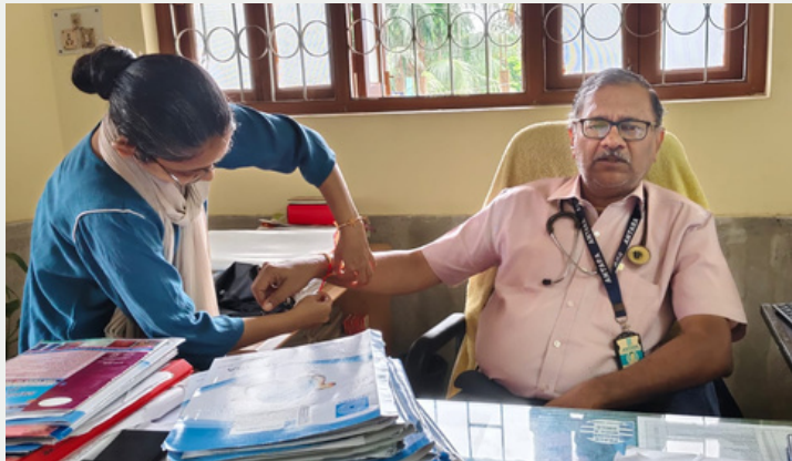
On 19th August 2024, Antara gathered to celebrate the beautiful bond of love and protection during our Raksha Bandhan ceremony.