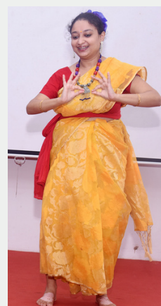
Talent Search – A Cultural Program for Residents of Antara conducted on 17th September 2024 as a part of Mental Health Week Observation.