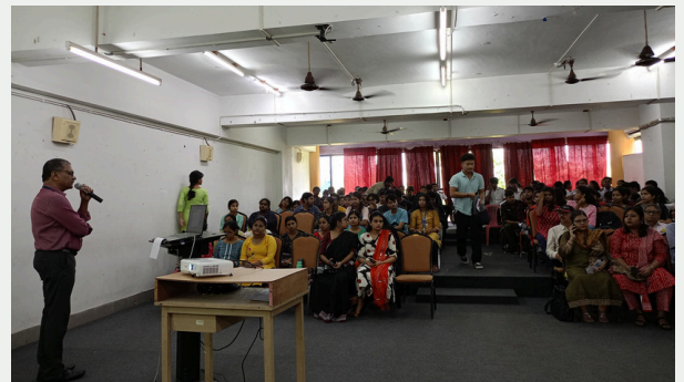
Awareness program for college students of Neotia University was conducted at their university campus on 18th September 2024 on "Creating a culture of care: Enhancing Mental Health & Suicide prevention in work place & beyond"