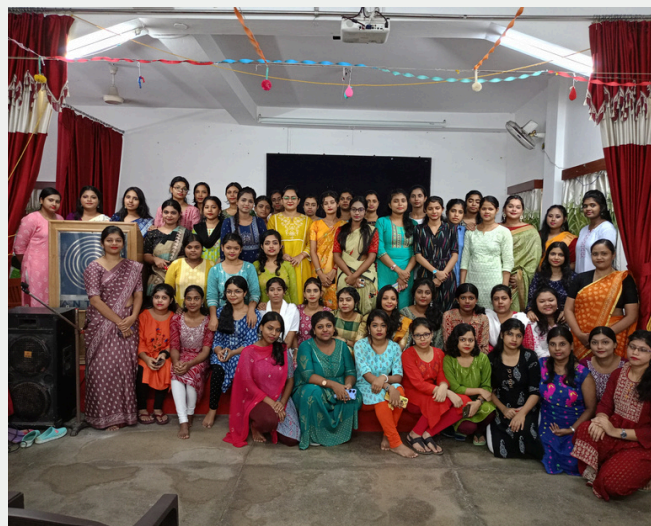
On 2nd August 2024, the 2nd Year GNM students of Woodlands Hospital organized a heartwarming recreational ceremony for the residents of Antara.