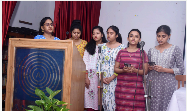
Inauguration of Mental Health Week on 13th September 2024 Theme unfolding - "It is Time to Prioritize mental health in the Workplace"