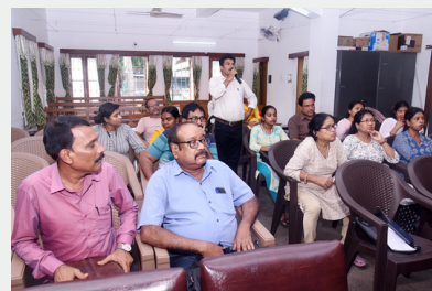
Workshop on “Role of NGOs in promotion of Mental health” on 21st September 2024