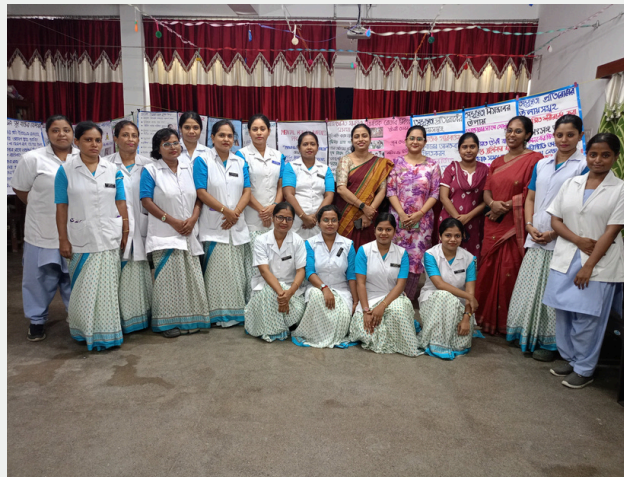
On July 26, 2024, MSc Nursing Part II students from Nil Ratan Sircar Medical College and Hospital (NRSMC&H) organized an impactful awareness program at Antara. The event's theme was "Mental Health Awareness - Moving More For More Mental Health."