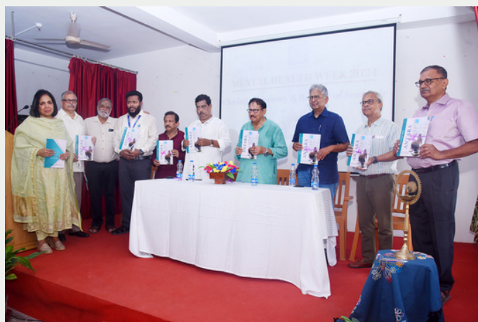
The Closing Ceremony and Release of the Souvenir at Antaragram on 22nd September 2024, marking the conclusion of our Mental Health Week Observation.