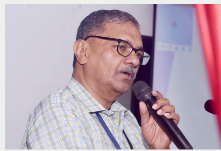
Seminar on "Self-care- Work life balance -Setting boundaries."

Coping with Visually Impairment: Helping the persons face the truth on 16th September 2024