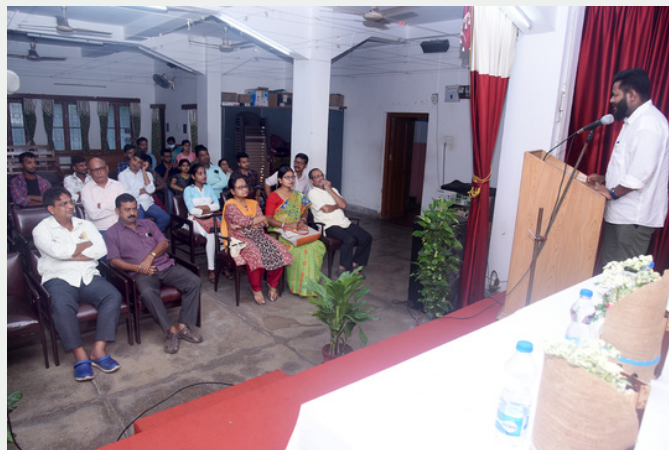
Seminar on "Addiction and Mental Health in the Workplace" on 15th September 2024.